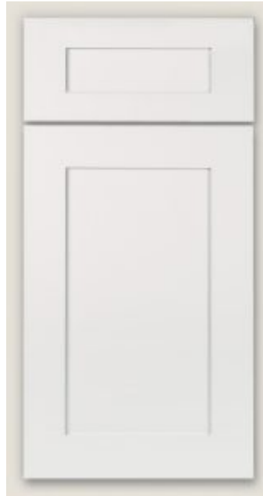
Style: Seamless Shaker