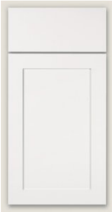
Style: Simple Shaker