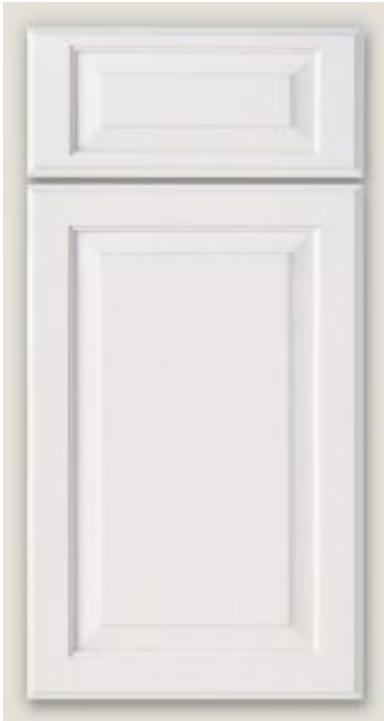
Style: Benton Square