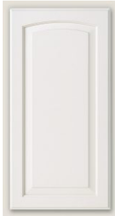
Style: Benton Brow